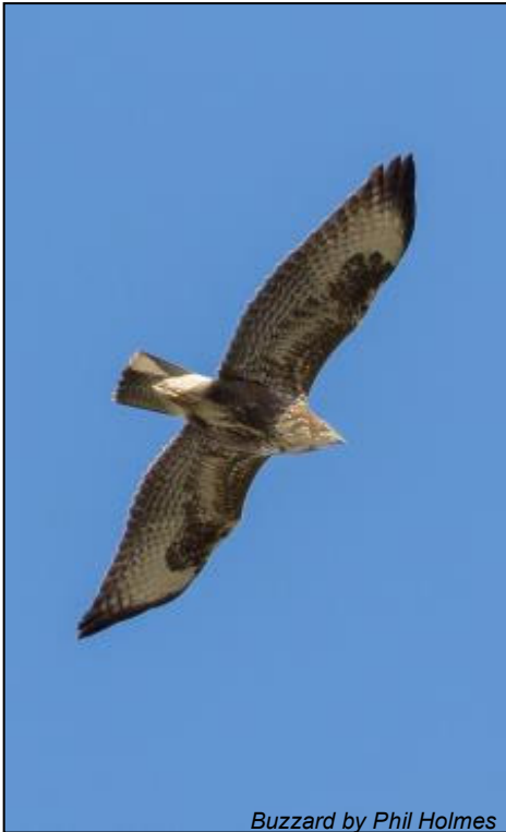
Buzzard