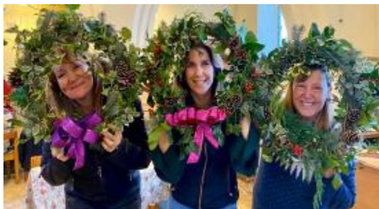
A few great wreaths from our workshop in 2019!

Join us in front of the woodburner to soak up the festive spirit and create a wonderful decoration for your home – or a great early Christmas present for lucky friends and family!