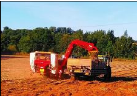
Local potato harvest

after the disastrous yields of harvest 2020, this year, 2021, eventually produced 5-year average crops. Rather better than was originally expected. The fields are now very visibly turning brown and green once again, as crops are established in readiness for harvest 2022. Arable farmers enjoy this time of year as it gives them a chance to make a fresh start and forget the mistakes they may have made in the management of the previous year's crops! But over-all the outcome this year has been satisfactory, if not without a bit of concern on the way. The potato harvest is a case in point.