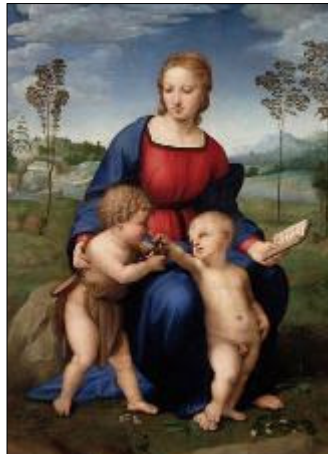
Madonna of the Goldfinch by Raphael

Goldfinches often join up into large flocks in winter, and they can be seen swooping down on fields where their favourite seeds may still be available. Sadly, European goldfinches are still commonly kept and bred in captivity around the world because of their distinctive appearance and pleasant song. The RSPB has campaigned against this practice.