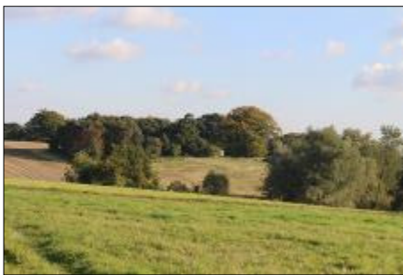
Woodland near Rosery Lane

They make a vital contribution to our efforts to combat climate change and also provide important ecological habitats, supporting a wide range of wildlife. Oak trees, for example can help to sustain hundreds of insect species, mammals and birds. They are still a familiar sight along our hedgerows although, sadly, there are now very few of the pollarded oaks that used to line footpaths to mark parish boundaries.