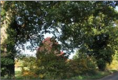
Hedgerow trees in Hall Farm Road

whose houses are hidden from the road behind hedges.