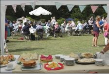
Ah, homemade cakes .....