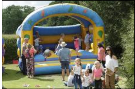
Every Fete needs a bouncy castle