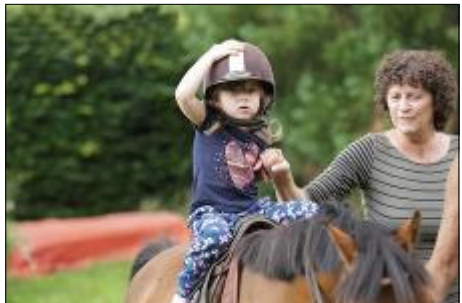
Is this the Gold Cup?