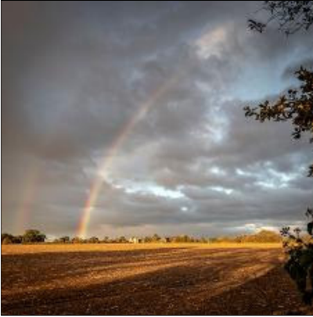
Rainbows over Culpho