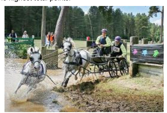
Obstacle driving, Sandringham

Tandem drivers are a rare breed. their main qualities being determination and a sense of humour: it's an unpredictable class and anything can go wrong. There were only three pony tandems at Cirencester vet they were very closely matched and they finished just 2.73 penalties apart, the gap narrowing from Fridav's after dressage competition, to 7.57 after the marathon and obstacle driving phase on Saturday. The cones course on Sunday juggled with the scores again to leave first-timer