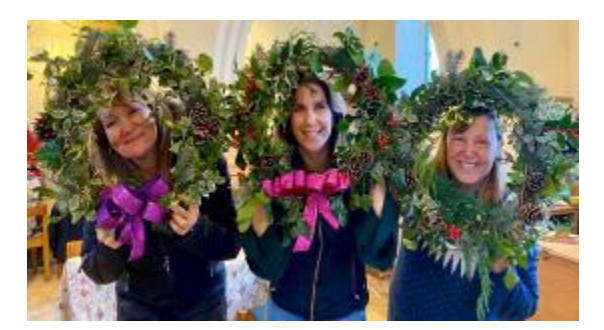
A few great wreaths from our workshop in 2019!

Join us in front of the woodburner to soak up the festive spirit and create a wonderful decoration for your home – or a great early Christmas present for lucky friends and family!