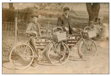
Villages seem to have more much more self-sufficient. Of course, the range of

and, in due season, off to the sugar beet supplies on offer was much more limited, factories Burv St Edmunds in or Sproughton, or nearby maltings. The supply lines otherwise seem to have been conducted by local vans or even bicycles. and rarely to have extended outside the county, apart possibly from London. where most of the traffic was from our farmers sending their produce to the big citv.