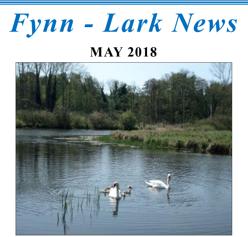
The Mere, Hill Farm, Playford

Two years after moving to Playford in 2006 we decided that the time had come to get another dog but before doing so, I started to walk the area and discovered just how blessed we are in our four villages from which emanate a large variety of wonderful walks - no need to get into a car.