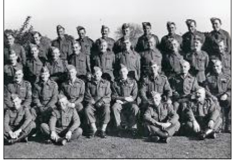
Bealings Home Guard - together in time of war. Now – together in time of peace.

having a major input from the perspective of Little Bealings, so this is very much a project that sees the two villages as one entity, with so many shared enterprises over the course of time: the Village Hall, the WI, the Home Guard, Scouts, Church Choir, Quoits, Drama – to say nothing of the ways in which families have crisscrossed across the two villages. Both Parish Councils are fully supportive of the project.