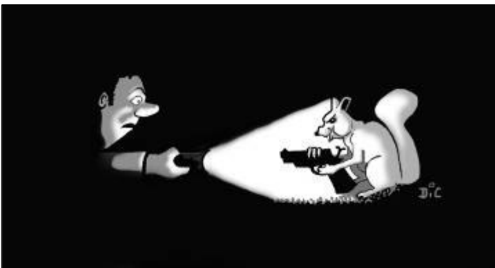
Roof spaces are potentially dangerous places

There is lots more information on our website www.eandspestsolutions.co.uk or if you prefer to speak to a human, please feel free to contact us for further advice or assistance on 01473 328092 or 07979 301334.