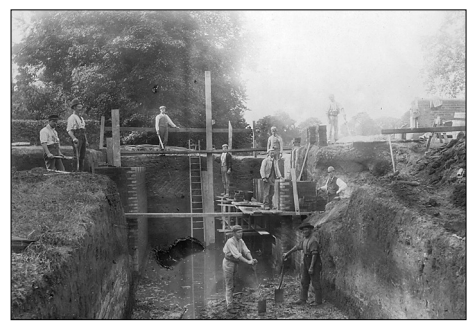
Bridges - Great Bealings, Little Bealings, Playford