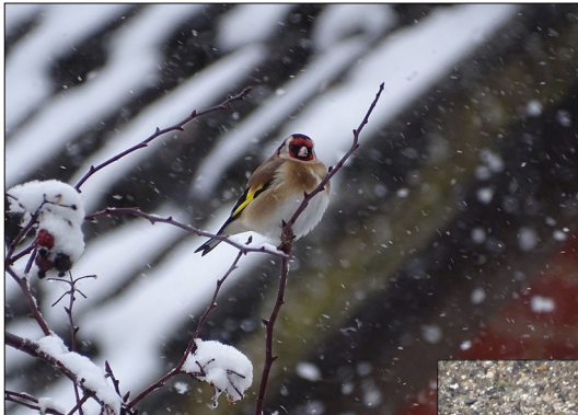
We are indebted to Wendy Wilson for these photographs which are a reminder that our birds need help not just in winter but throughout the year.

There are different mixes for feeders, for bird tables and for ground feeding. The better mixtures contain plenty of flaked maize, sunflower seeds and peanut granules.