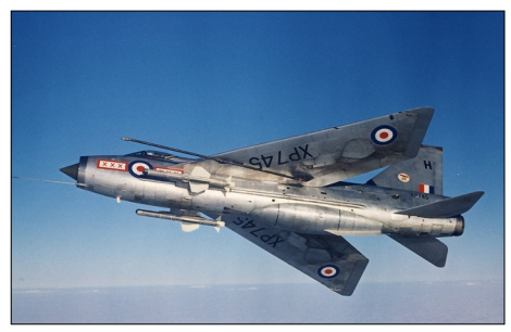
The ventral tank is the lozenge-shaped bulge with 2 thin black stripes and a fin on the bottom of the fuselage between the wings. The second picture is of Mike strapping in before a flight on detachment in Cyprus, hence the shorts.