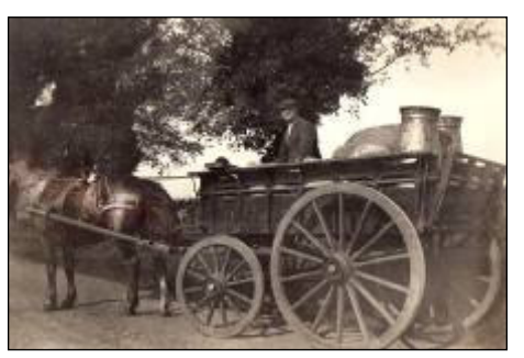
image showing how our milk used to be delivered – not quite the same as Milk & More, ordered on line, but, happily, still delivered in these parts, despite the competition of much cheaper milk from supermarkets.

The proposed book could include: village signs, because those signs are often evidence as to how villages see themselves historically; images of houses