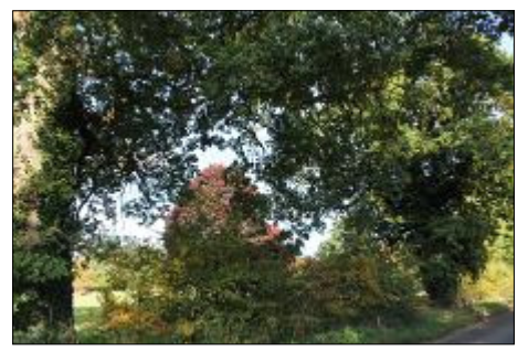
Hedgerow trees in Hall Farm Road