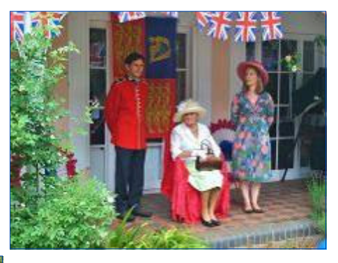
A 'Royal' presence