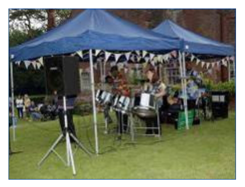
And the band played on .....