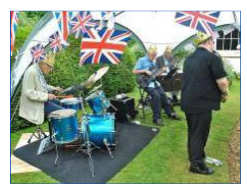
At least we are dry!