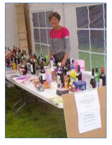
Tombola ticket anyone?