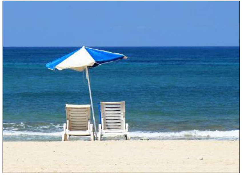
Editorial staff holiday destination - back in September?

There seems to be a lot of gloom around nowadays, despite our really quite pleasant summer weather. A country divided over Brexit. Government and opposition divided over the same issue. Instability in world politics, with powerful but not necessarily predictable strong men calling the shots. Financial shortfalls and reported shortcomings in virtually every public service you might care to mention. We, as individuals, feel that we have no influence whatsoever on world issues, and precious little influence over wider national issues, and can but stand helpless on the sidelines while uncertainty swirls around us. The old cliché of solving the world's problems over a pint is a very temporary, self-delusory consolation for our impotence. Standing on the side-lines, on the edge of the pitch while the drama is played out