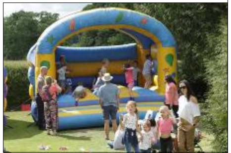
Every Fete needs a bouncy castle