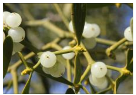
Mistletoe is a parasitic plant. The sight of its bulging green clumps in a tree can be

In pagan times mistletoe was considered a symbol of fertility, for reasons which must go unexplained in this family magazine. The Romans considered it an emblem of peace, and in the Christian era standing beneath it - not only that, but it was considered bad luck to refuse the offer. What would the Me-too movement you want a healthy tree. have made of that?