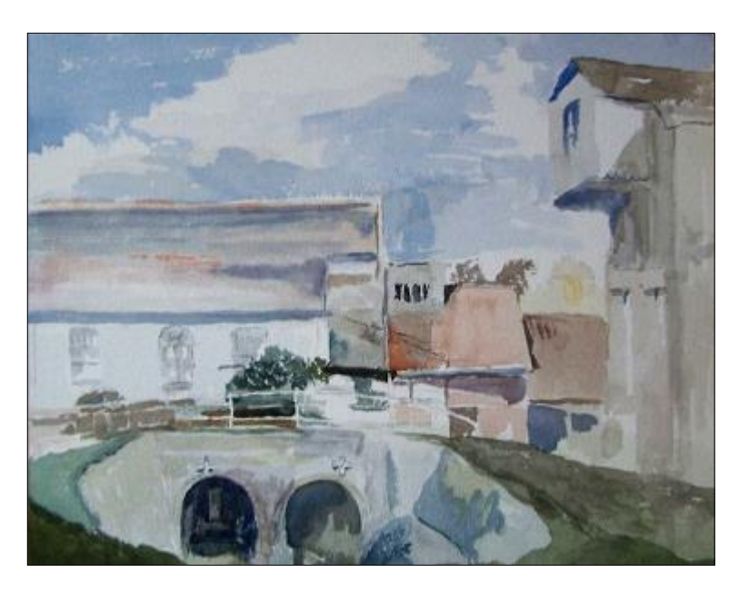
"Wickham Market Mill" by Ron Hurlock This is just one of the pictures which will be on show at Plant Sale and Fair (details opposite pg.13)