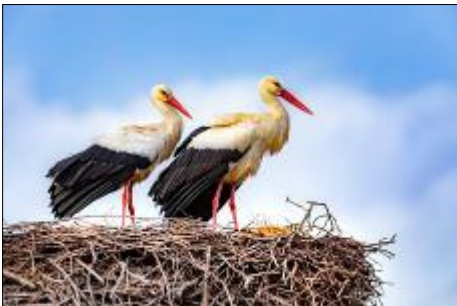
White storks are native to south-western and north-western Ukraine.

The Ukrainian Red Book lists approximately 385 endangered species. Ironically it is reported that the isolated or abandoned zone of the Chernobyl nuclear power station disaster around the city of Chernobyl, while evacuated of all human habitation, has an abundance of wildlife which are reported to be multiplying in numbers. However, reports indicate that bird brains are 5% smaller in size, and the insect and spider population is in decline.