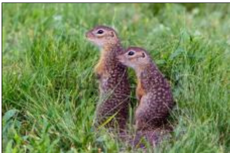
The speckled ground squirrel is a native of the east Ukrainian steppes.

The Ukrainian Red Book lists approximately 385 endangered species. Ironically it is reported that the isolated or abandoned zone of the Chernobyl nuclear power station disaster around the city of Chernobyl, while evacuated of all human habitation, has an abundance of wildlife which are reported to be multiplying in numbers. However, reports indicate that bird brains are 5% smaller in size, and the insect and spider population is in decline.