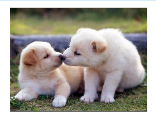
Pet Service Sunday April 29<sup>th</sup> 10.00 a.m. Playford Church

A thanksgiving for companionship and faithfulness All four footed furry friends and any other pets welcome!